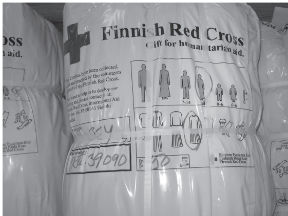
A bundle of clothes from the Red Cross in Finland waits to be donated to people in need.