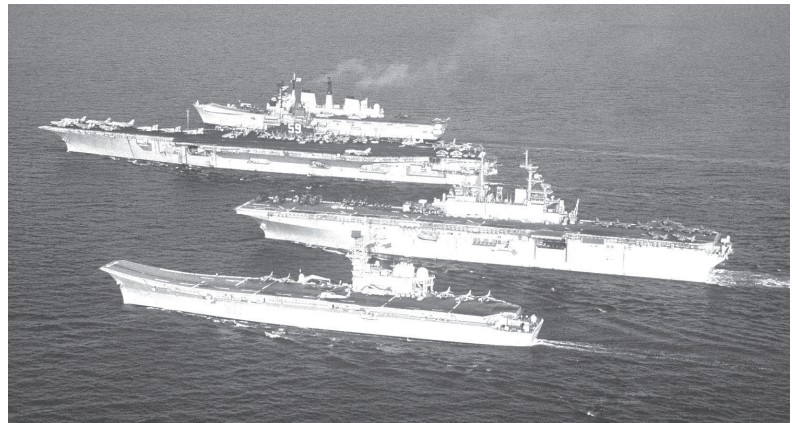
American, British, and Spanish ships participate in a North Atlantic Treaty Organization (NATO) military exercise.

“Inter” means among or between . It is a prefix that shows there is a connection between things. Intergovernmental organizations are organizations that are formed between governments. They are based on formal agreements between three or more countries that have come together for a specific purpose. For example, several governments might come together to share the national experts and resources to develop solutions for fighting hunger around the world.